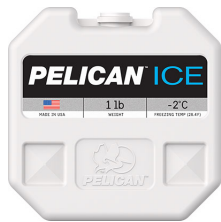
PI-1LB 1lb Ice Pack