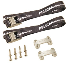
TDKIT Tie Down Kit