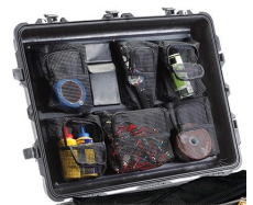
1639 Lid Organizer