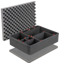
1600TPKIT TrekPak Case Divider Kit