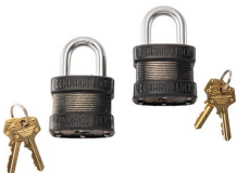
PL2 Padlock (2 pack)