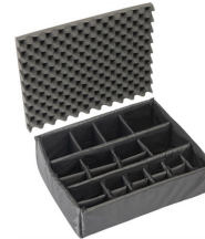
1605 Padded Divider Set