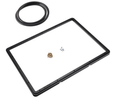
1550PF Special Application Panel Frame