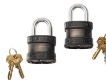
PL2 Padlock (2 pack)