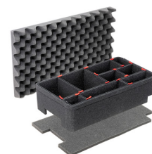
1510TPKIT TrekPak Case Divider Kit