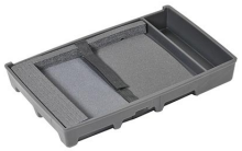
1499C Computer Bottom Insert