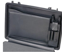
1498 Computer Lid Organizer