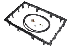
1490PF Special Application Panel Frame