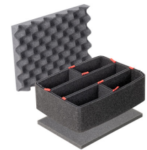
1400TPKIT TrekPak Case Divider Kit