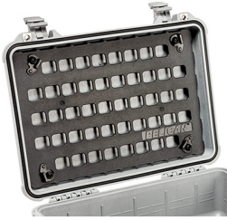
1500MP EZ-Click™ MOLLE Panel