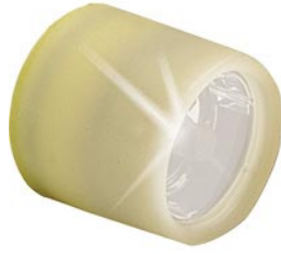
2413PL Photoluminescent Shroud