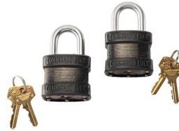
PL2 Padlock (2 pack)

Pelican 23215 Early Ave • Torrance, CA 90505 USA • Phone: (310) 326-4700 • (800) 473-5422 • Fax: (310) 326-3311 sales@pelican.com • www.pelican.com