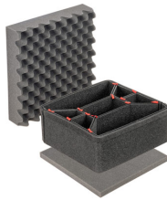
iM2275TPKIT TrekPak Case Divider Kit