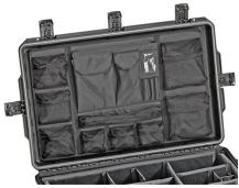
iM2875-UTILITYORG Utility Organizer