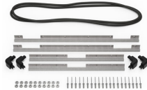
iM2750-BEZEL-LID Lid Bezel Kit