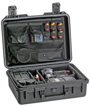
iM26XX-PHOTPALLET Photography Pallet