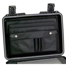
iM2300-LIDORG Lid Organizer