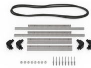
iM2300-BEZEL-LID Lid Bezel Kit