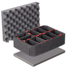
iM2100TPKIT TrekPak Case Divider Kit