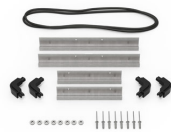
iM2100-BEZEL Base Bezel Kit