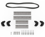
iM20XX-BEZEL Base Bezel Kit