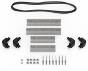
iM20XX-BEZEL Base Bezel Kit