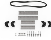
iM20XX-M4-BEZEL Base Bezel Kit (Metric)