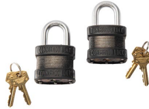
PL2 Padlock (2 pack)