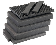
1607AirFS 3 pc. Replacement Foam Set