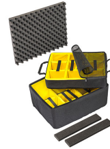
1607AirDS Padded Divider Set