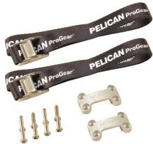
TDKIT Tie Down Kit