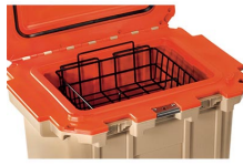
30-WB Dry Rack Basket