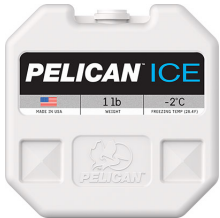
PI-1LB 1lb Ice Pack