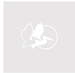
AL3022-0705RPFC With Foam, With Casters