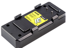
9416 Deck/Dash Charger Base Unit