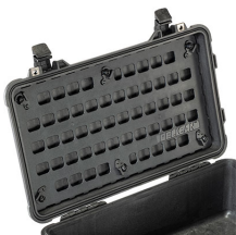
1510MP EZ-Click™ MOLLE Panel