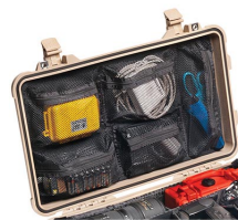
1519 Lid Organizer