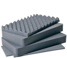
1511 4 pc. Replacement Foam Set