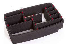
1510EUTP TrekPak Case Divider Kit