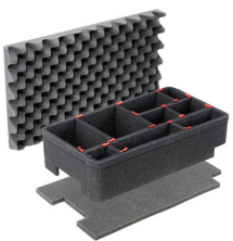
1510TPKIT TrekPak Case Divider Kit