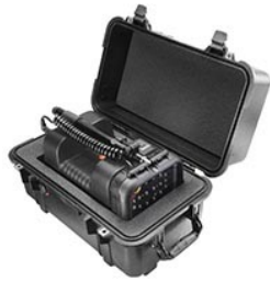
1460AALG 1460 Case with custom fit foam