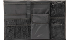
iM26XX-UTILITYORG Utility Organizer