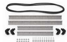
iM2620-M4-BEZEL Base Bezel Kit (Metric)