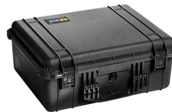
1550NF No Foam