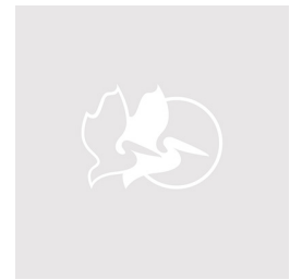
AL4824-1404RPFC With Foam, With Casters