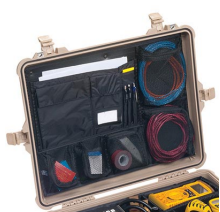
1609 Lid Organizer