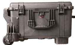
1620MNF No Foam