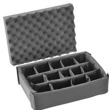
iM2200-DIV Padded Divider Set