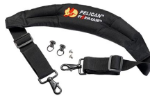
iM-STRAP-S-VER2 Padded Shoulder Strap