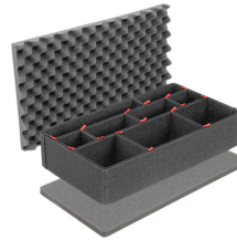
1555TPKIT TrekPak Case Divider Kit