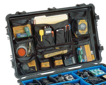
1659 Photo/Lid Organizer