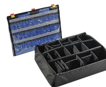
1555EMS EMS Accessory Set (Lid Organizer and Divider Set)