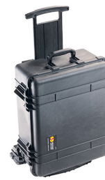
1560MWF With Foam