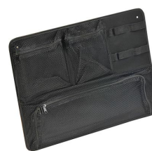
1569 Lid Organizer