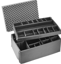
iM3075-DIV Padded Divider Set