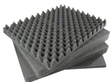
1771 4 pc. Replacement Foam Set