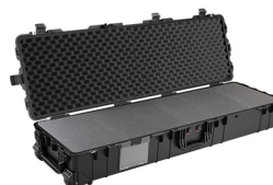
1770WF With Foam