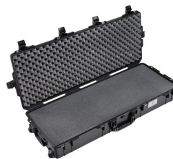
1745WF With Foam