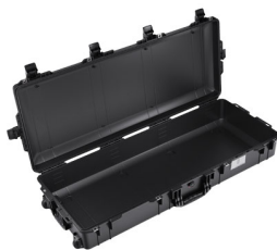
1745NF No Foam