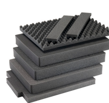
1607AirFS 3 pc. Replacement Foam Set

23215 Early Ave • Torrance, CA 90505 USA • Phone: (310) 326-4700 • (800) 473-5422 • Fax: (310) 326-3311 sales@pelican.com • www.pelican.com