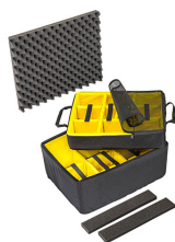
1607AirDS Padded Divider Set