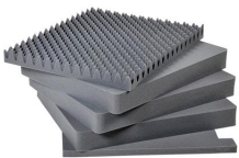
1691 5 pc. Replacement Foam Set