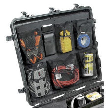
1699 Lid Organizer