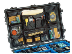
1659 Photo/Lid Organizer