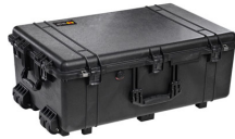
1650NF No Foam