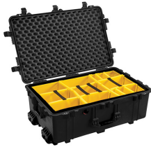
1654 With Padded Dividers