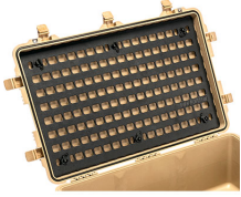
1650MP EZ-Click™ MOLLE Panel