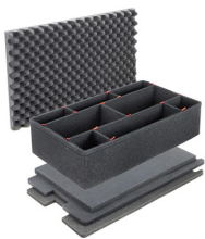
1650TPKIT TrekPak Case Divider Kit