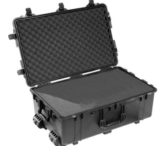
1650WF With Foam