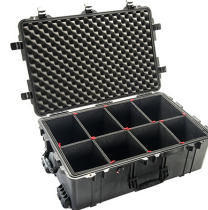
1650TP With TrekPak Divider System