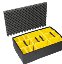
1655 Padded Divider Set