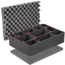
1520TPKIT TrekPak Case Divider Kit