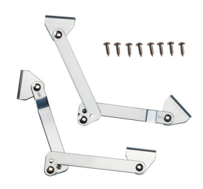
KIT-LIDSTAY-CARGO Cargo Lid Stays