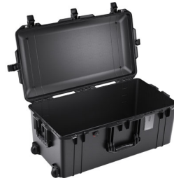
1626NF No Foam