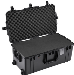
1626WF With Foam