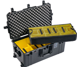
1626WD With Padded Dividers