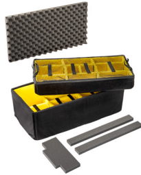
1626AirDS Padded Divider Set