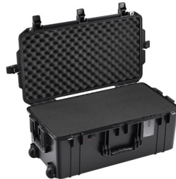
1606WF With Foam