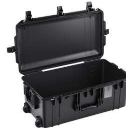
1606NF No Foam