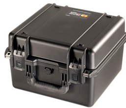
iM2275-X0000 No Foam