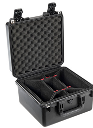
iM2275-X0006 With TrekPak Divider System