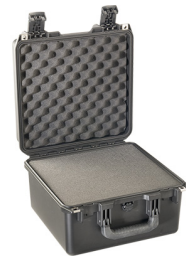
iM2275-X0001 With Foam