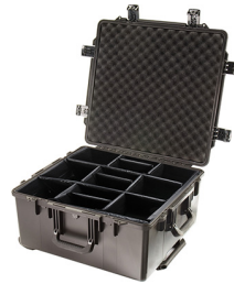
iM2875-X0002 With Padded Dividers