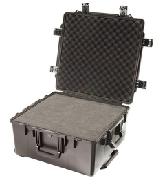
iM2875-X0001 With Foam