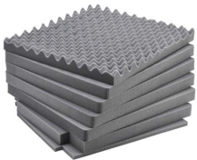
iM2875-FOAM 7 pc. Replacement Foam Set