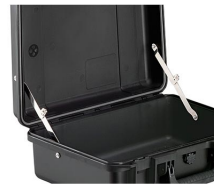
iM-LIDSTAY Lid Stay