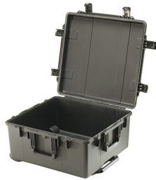
iM2875-X0000 No Foam