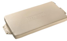
70Q-SEAT-TAN Seat Cushion - Tan