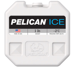
PI-1LB 1lb Ice Pack