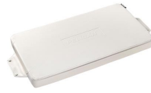
70Q-SEAT-WHT Seat Cushion - White