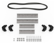
iM20XX-BEZEL Base Bezel Kit