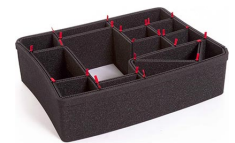
1550EUTP TrekPak Case Divider Kit