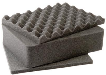
1401 3 pc. Replacement Foam Set