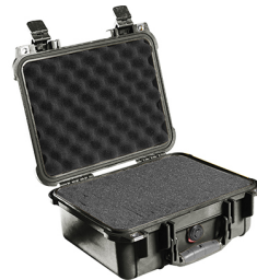
1400WF With Foam