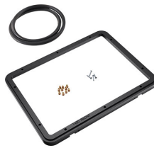
1400PF Special Application Panel Frame