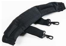
1432 Strap Kit