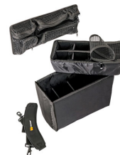
1435 Padded Divider Set