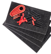
1506TPKIT TrekPak Case Divider Kit